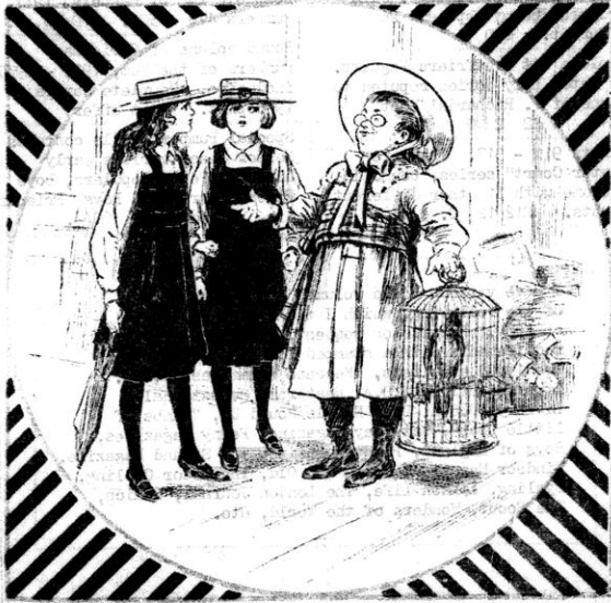
THE ARRIVAL OF BESSIE BUNTER! (Illustration from "The Girls of Old Newbury" by "The Girls of Old Newbury" by "The Girls of Old Newbury")